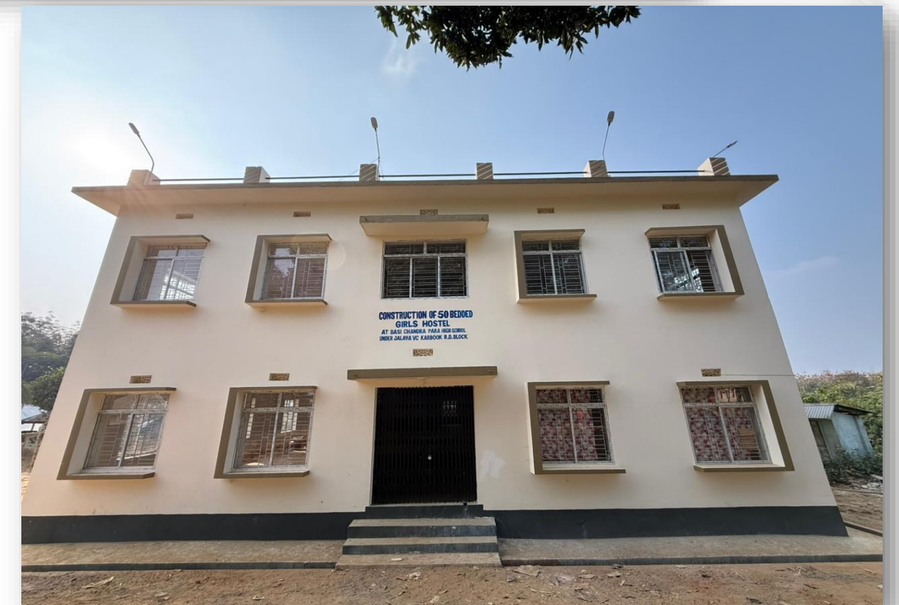
Inauguration of Bashi Chandra Para Boys' (50 bedded) & Girls' (50 bedded) Hostels at Karbook by Hon'ble Chief Minister, Govt. of Tripura